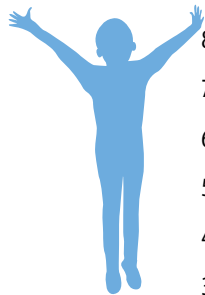
IDENTIFY BEST FIT STANDARD